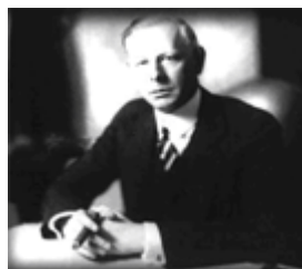
Jesse L. Livermore