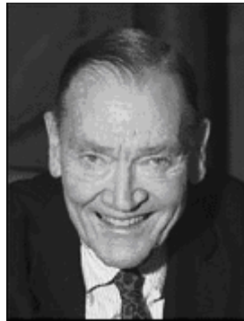
John (Jack) Bogle