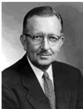
Thomas Rowe Price, Jr.